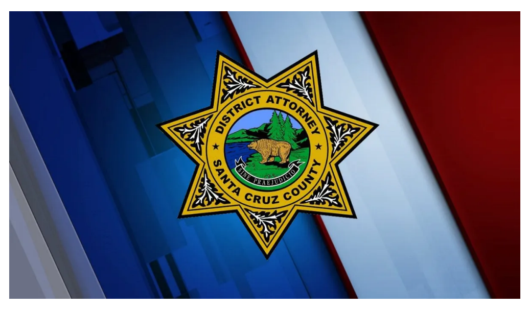
Santa Cruz County District Attorney's Office